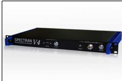
Remote Analyzers (Page 5)