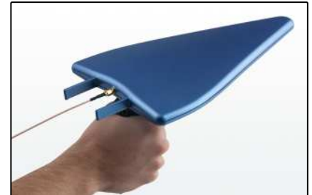
Directional Antennas (passive: Page 6, active: Page 7)