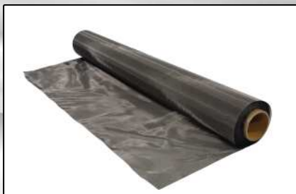
EMC & RF Shielding material (Pages 11-12)