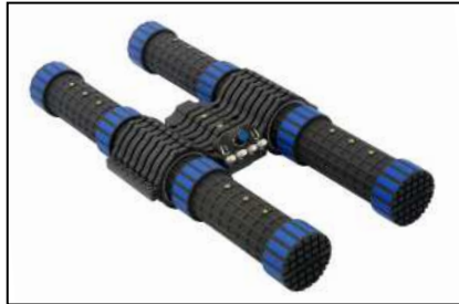
Magnetic Antennas (Page 9)