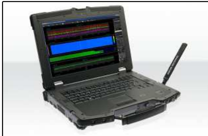
Outdoor Analyzers (Page 4)