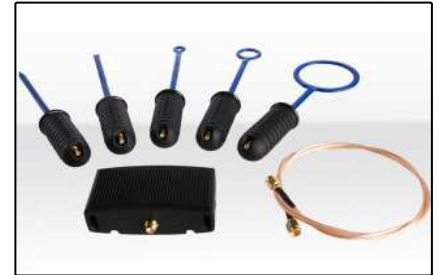
Probe Sets (Page 10)